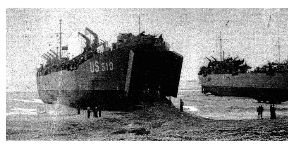
Figure 5. SS Buncombe County (LST-510) Beached at Normandy Beachhead, June-August 1944.

One of the LSTs that collided with the SS Chapel Hill Victory in the English Channel was the LST-510, which had already seen significant action in the war. By a strange coincidence, it would later be renamed the SS Buncombe County . Built at Jeffersonville, Indiana, in 1943, the tank landing ship proceeded down the Mississippi River to New Orleans, where it was loaded with a tank landing craft and ammunition. It sailed north to Nova Scotia in March 1944, and there joined a 64 ship North Atlantic convoy. The journey was difficult and hazardous; four ships in the convoy were torpedoed by German U-boats. After unloading the tank landing craft in Plymouth, England, in May 1944 the ship was outfitted for an undisclosed mission. The nature of the mission became clear in early June when the ship was loaded with 70 vehicles and 200 U.S. Army infantry soldiers; it was then ordered to join a 4000-vessel convoy headed for Normandy on D-Day, June 6, 1944.